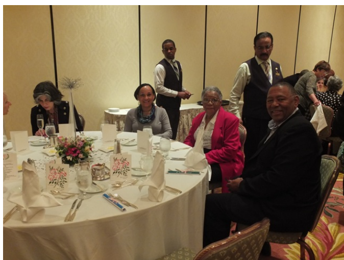
The Wade table