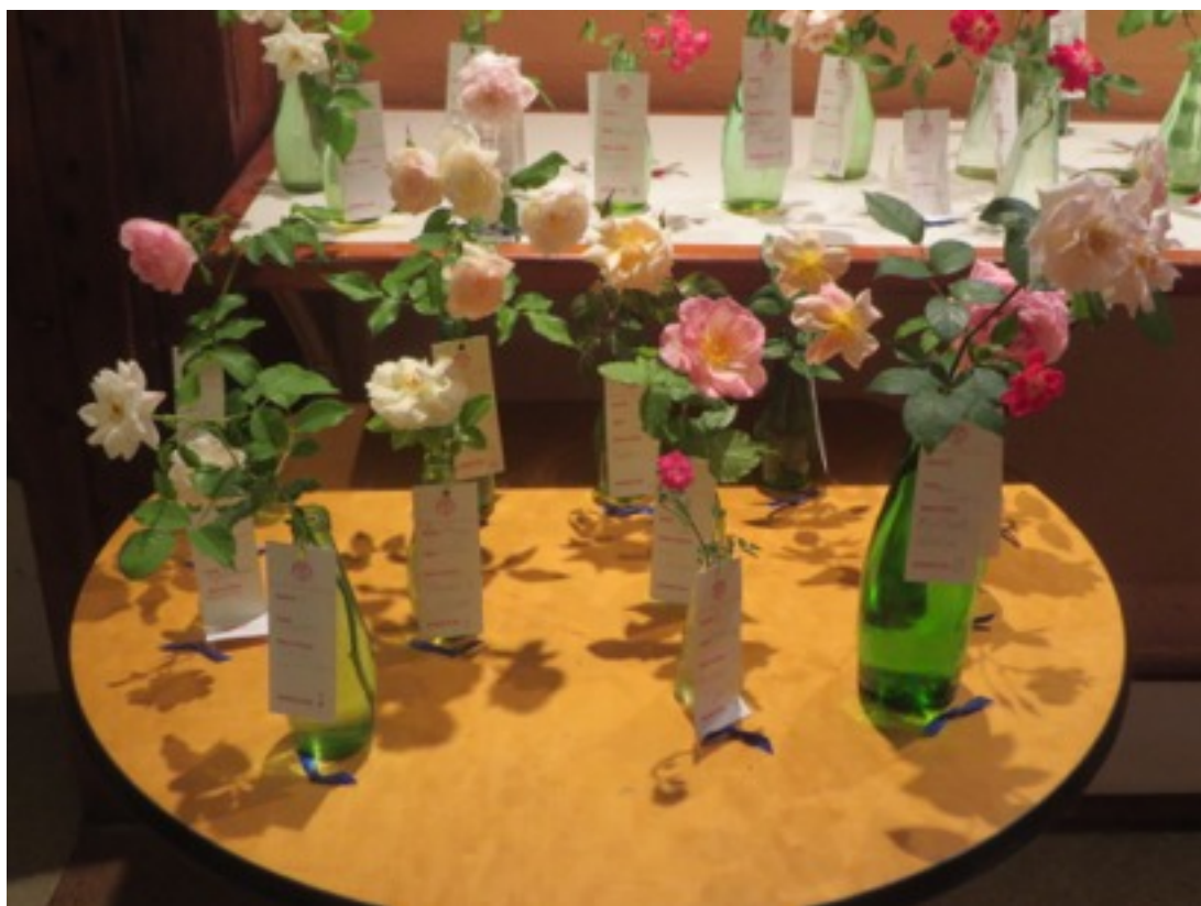
Candidates for best in show