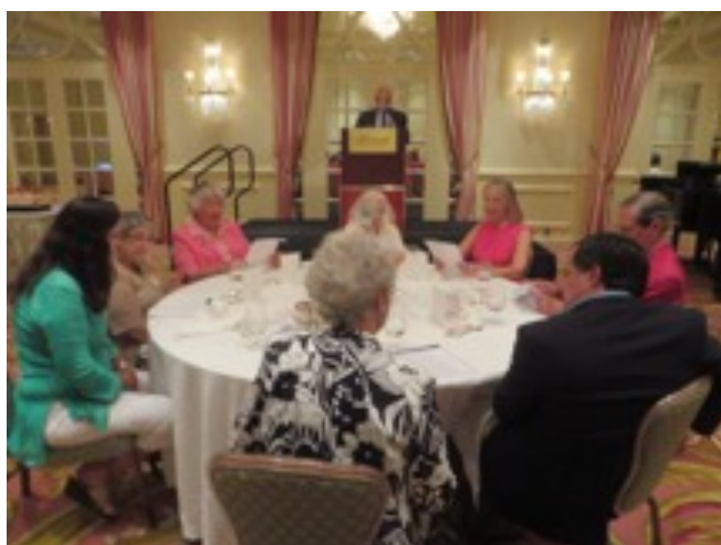
The Antonition Table