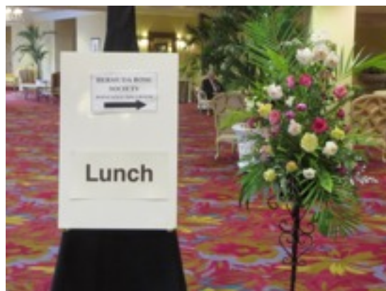
Entrance Arrangement by Diana Hindess