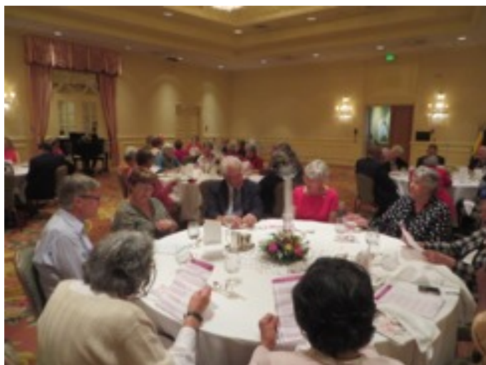
The Swift Table