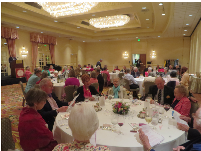
The Cooper Table