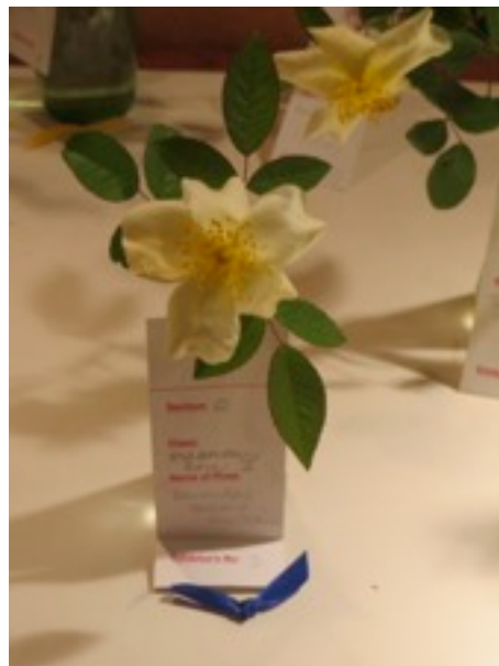
Bermuda's Yellow Mutabilis