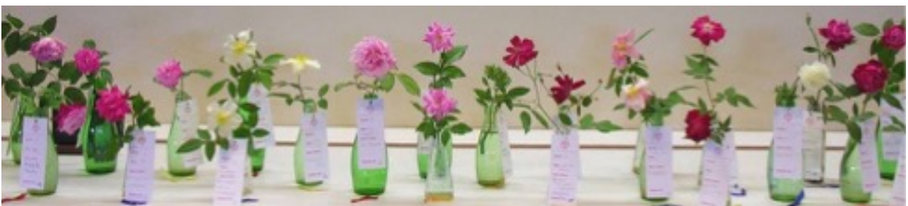
Part of the 20 Entry Bench at our November Meeting

The Waterville roses are blooming well and there may be other rose bushes that could be slipped. Any specific rose requests for the sale? We are in the process of pruning the Waterville rose bushes.