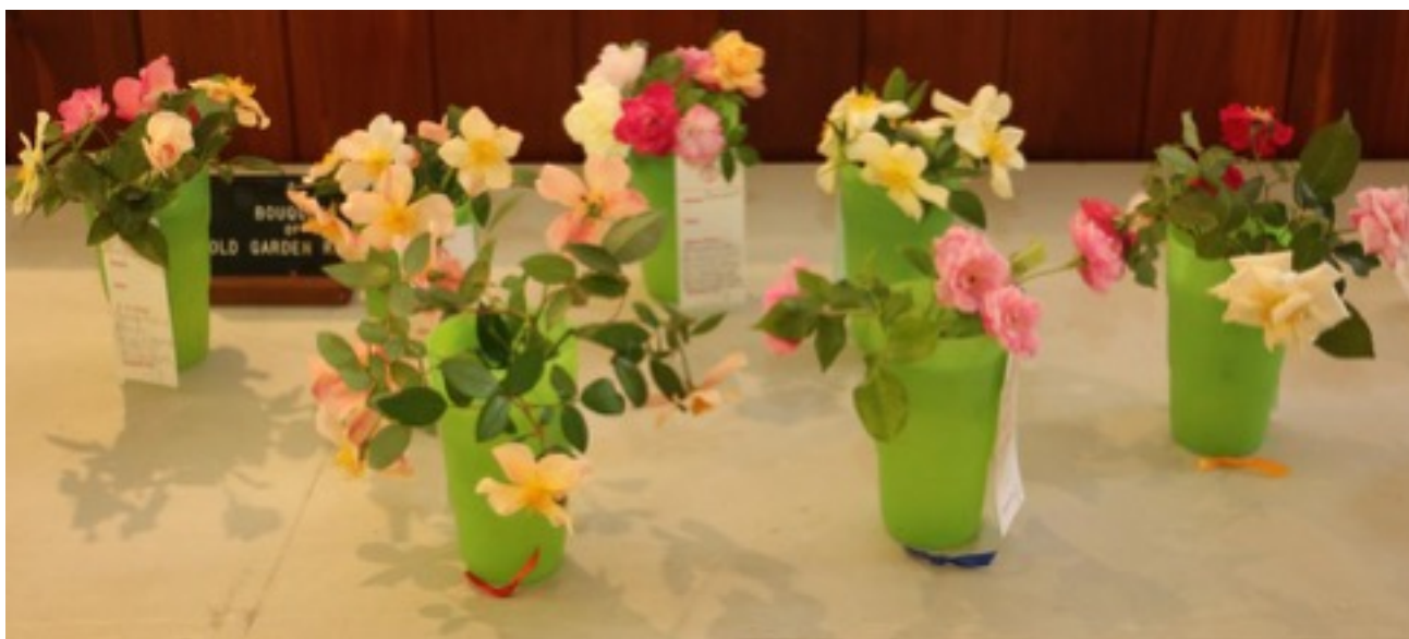
Bouquet of Old Garden Roses at our last meeting