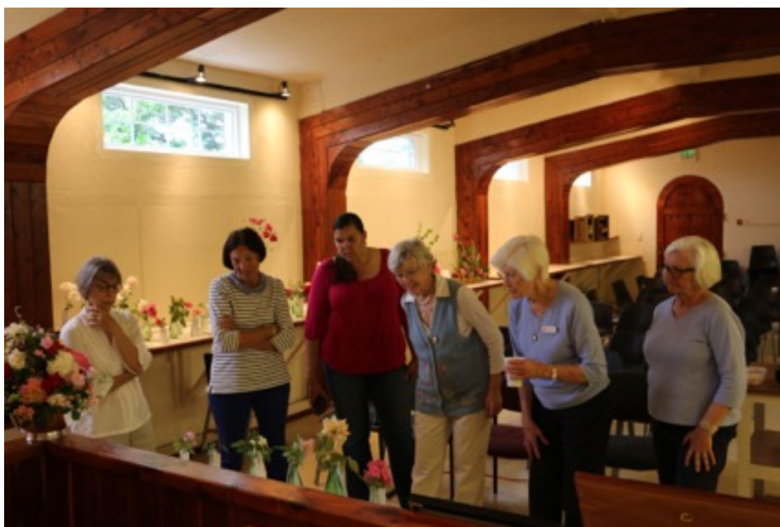
Our panel of four judges (center) judging Best in Show at the AGM