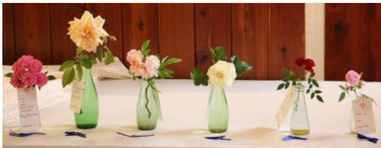
The six best in there own class going for Best in Show at our AGM meeting in May, finally the little Talbot Rose on the far right was voted Best in Show