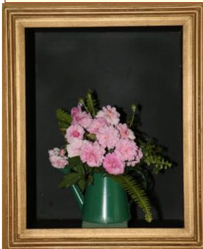
Mingo Cook Shadow Box won 2nd at at our last show Oct 7th