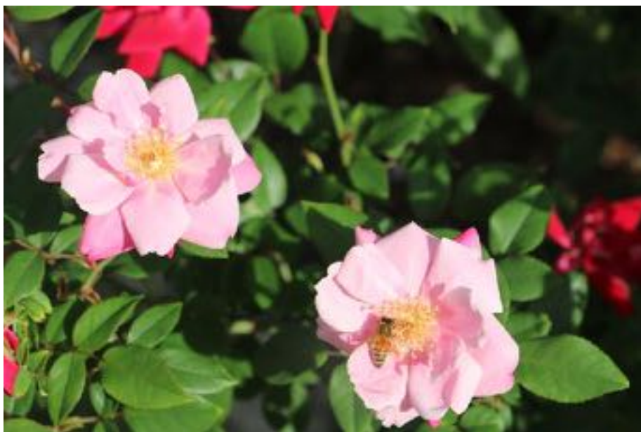
Archduke Charles looking stunning, photo taken this week, six weeks after Hurricane Nicole hit Bermuda

Please see the notice board at the 2nd December meeting for November's minutes.