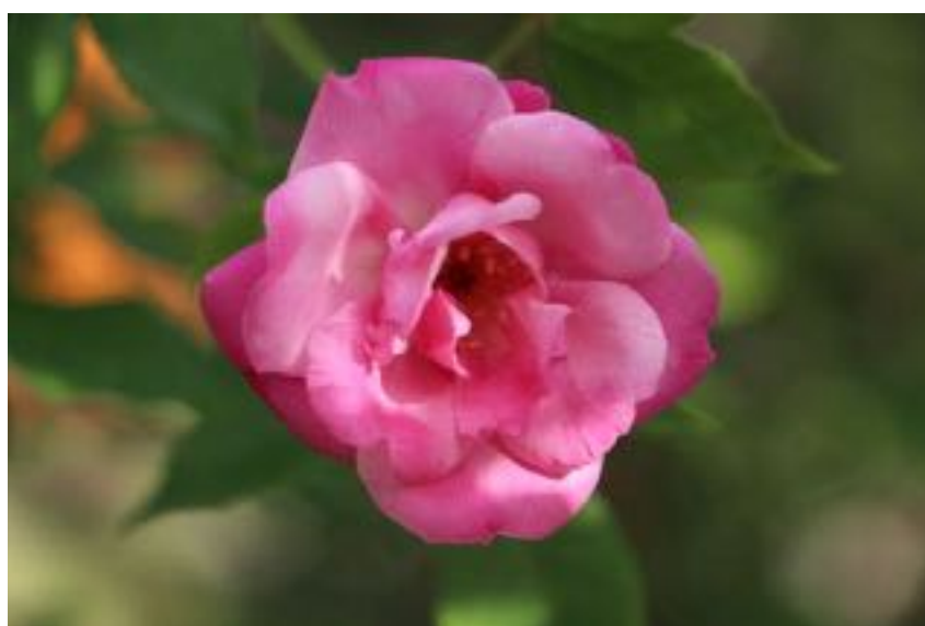
Red Smith's Parish photo taken this week

Small donation of $5 per participant to help defray costs